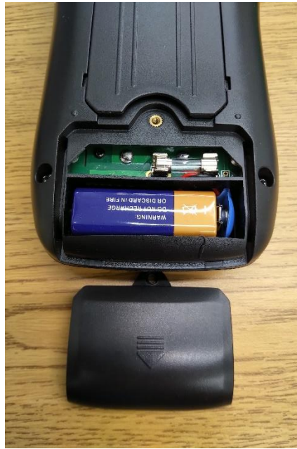
Figure 8: Black cover removed from bottom of V79 Multimeter

After the screw has been loosened fully, remove it and remove the black cover from the bottom of the multimeter by following the arrow imprinted on it and slide the cover down, seen below in Figure 8.