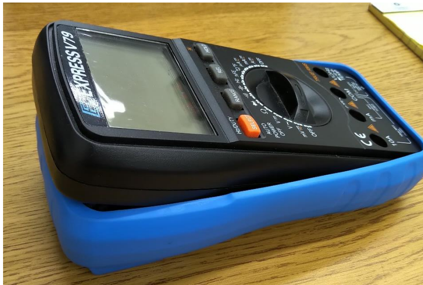
Figure 4: Rubber casing being removed from the multimeter

Begin to separate the V79 Multimeter from its blue, rubber casing, as seen in Figure 4 below. Pry the top of the meter first, so that the plastic stand on the back of the meter does not get stuck and damaged.