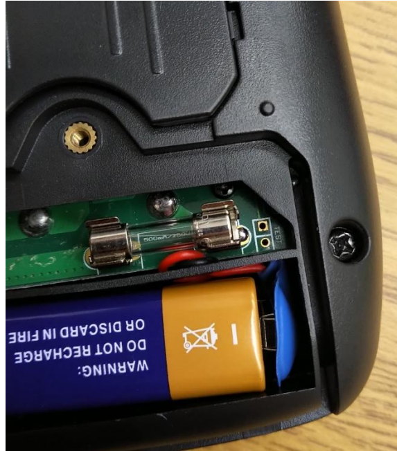
Figure 16: The battery securely placed back into its spot

It may take several attempts to safely and neatly place the battery back into its slot. Be careful that when you sit the battery all the way down that the terminals do not come loose or disconnect from the blue tab. A loose or poor connection can result in a damaged multimeter. As seen below in Figure 16, there is little room for error.