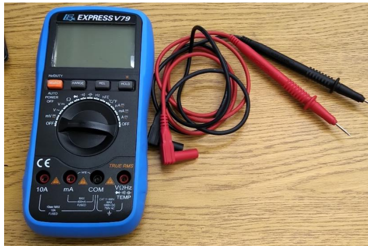
Figure 2: Express V79 Multimeter