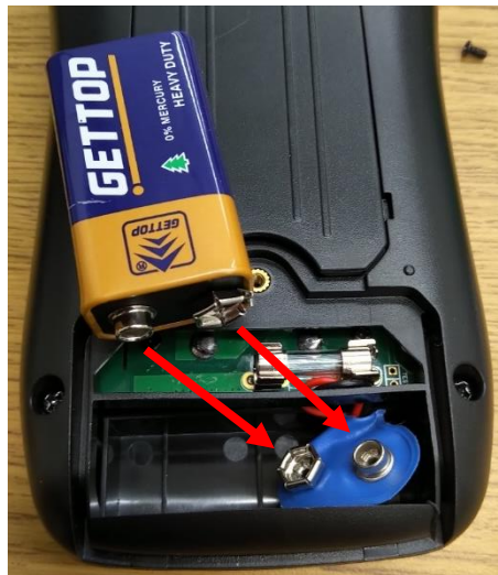
Figure 15: The appropriate battery connections

After the fuse has been set, it's time to put the battery back in. Be sure to attach the blue tabbed terminals to the correct battery terminals. Be sure not to twist the positive and negative (red and black) wires of the blue tab. It is bad for the wire and it will be harder to set the battery. The terminal connections can be seen below in Figure 15.