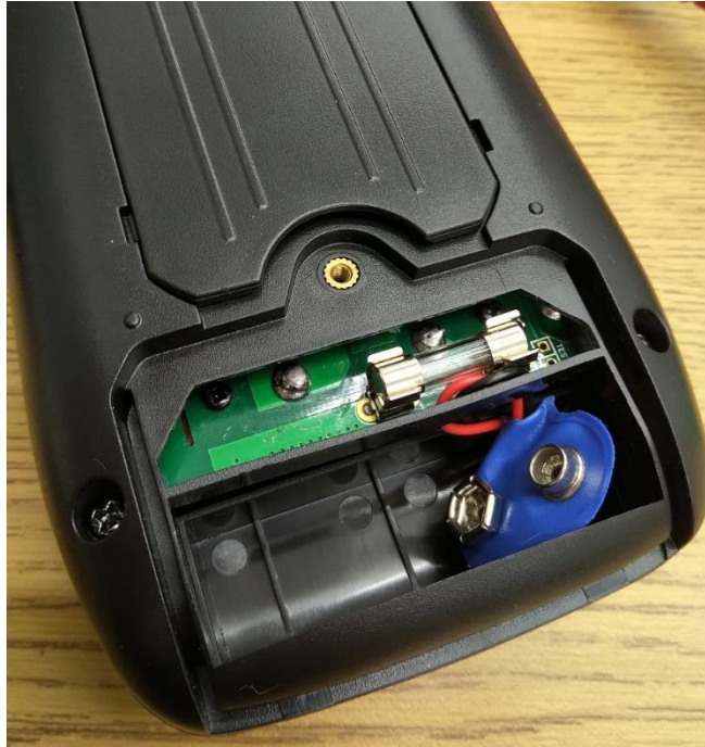
Figure 14: The replaced fuse in the multimeter, it has already been set

Replace the broken fuse with an equivalent fuse (there should've been a bag of fuses included in your kit). There is no need for tools when putting the fuse back into the multimeter. Just line up the fuse and apply gentle pressure to secure the fuse. If you cannot push the fuse back into place, try securing one end first then securing the other. The replaced fuse can be seen below in Figure 14.