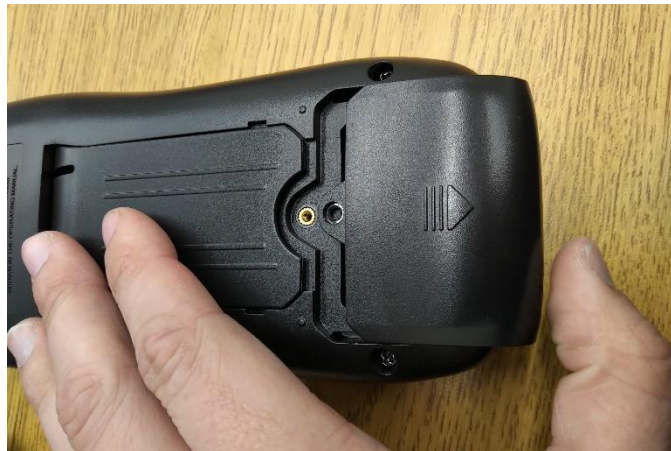
Figure 17: Sliding the cover back onto the multimeter

After the fuse and battery are both secured in their place, it is time to put the cover of the compartment back onto the Multimeter. Slide the black cover back onto the Multimeter being sure to even the sides of the cover in the track. This can be seen below in Figure 17.