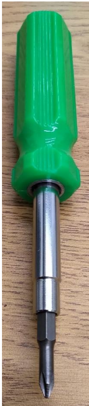
Figure 1: Phillips Head Screw Driver