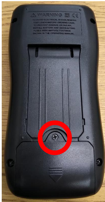
Figure 6: V79 Multimeter flipped over to expose back screw

After the rubber case and multimeter has been separated, flip over the multimeter to locate the single philips-head screw at the bottom of the meter. Circled below in Figure 6.