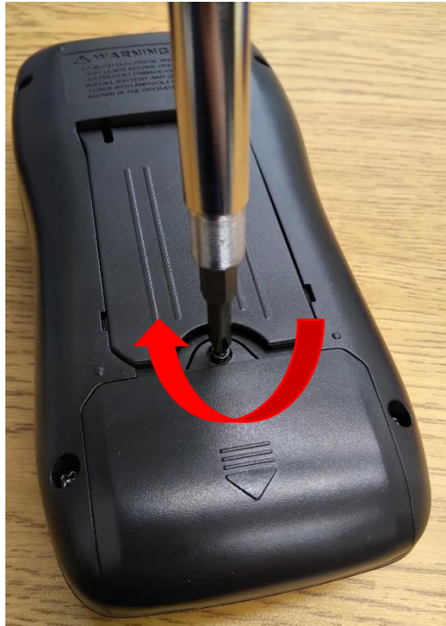
Figure 18: Tightening the screw by turning the screwdriver in a clock-wise rotation

After the cover is back in place, put the Phillipshead screw back into the slot and use the Phillipshead screwdriver to secure the cover. Gently turn the screwdriver in a clock-wise rotation until the screw is firmly in place. Do not over tighten the screw in fear of stripping the screw or the head of the screw! The process of tightening the screw can be seen below in Figure 18.