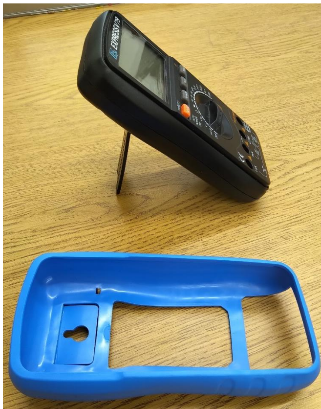
Figure 5: V79 Multimeter and rubber casing completely separated