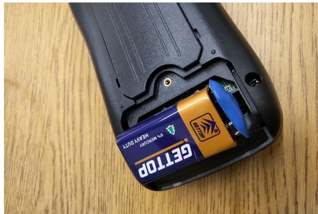
Figure 9: Battery lifted up out of its housing, still connected by the blue terminal tab

Carefully remove the battery from the V79 Multimeter by gently lifting up on it in a corner. Remember it is still connected to the multimeter, so do not aggressively force it up. The blue tab that holds the battery terminals can be seen below in Figure 9.