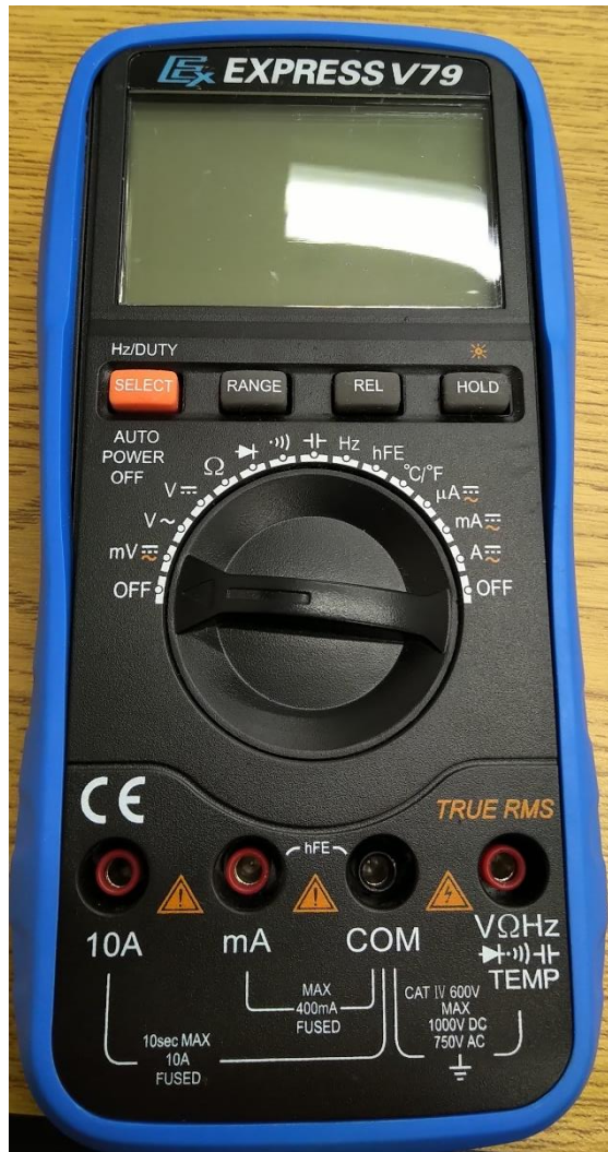
Figure 21: The finished product: the V79 Multimeter put back together with a replaced fuse.