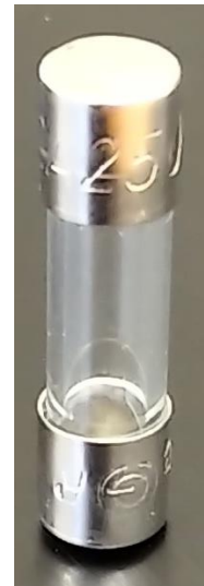
Figure 3: Appropriately rated, intact, spare fuse