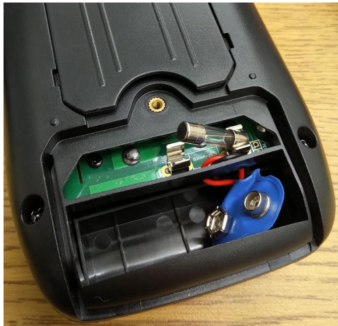
Figure 13: Freed fuse after being pried up by the tip of the probe.

Once the fuse has become free of the tab, place aside your test probe and gently grasp the exposed fuse with two fingers. Lift the fuse so that it is removed from the V79 Multimeter. The freed fuse can be seen below in Figure 13.