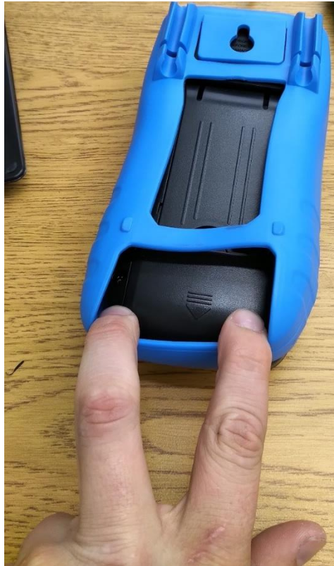
Figure 20: Using two fingers to slide the rest of the rubber casing back onto the multimeter

Continue to put the rest of the rubber casing back onto the multimeter. I found that it worked best to use two fingers to ease the rubber casing back on, for it might be a little resilient to flex. This can be seen below in Figure 20.