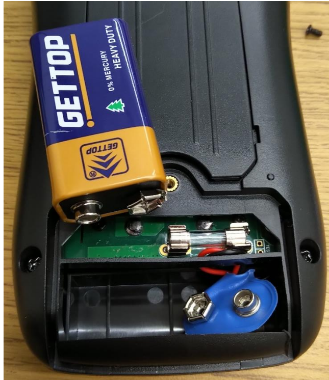
Figure 10: Separated battery and blue terminal tab

Place the battery off to the side for later when it is time to put the V79 Multimeter back together. This would be an optimal time to change the battery if that service is needed as well. Proper multimeter maintenance is an essential part of owning a multimeter in the first place!