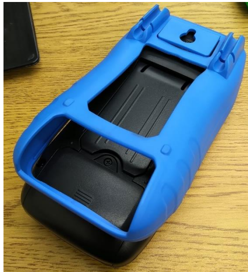
Figure 19: The top of the rubber case is slipped onto the meter first

After the cover is secured, you can begin to put the rubber casing back onto the multimeter. It is easier to slip on the top of the rubber case first, seen below in Figure 19.